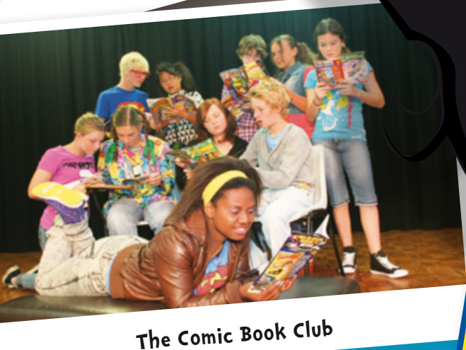
The Comic Book Club