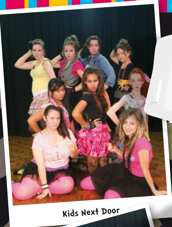
Kids Next Door