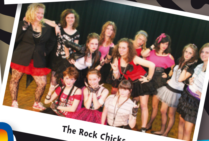
The Rock Chicks