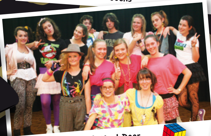
Kids Next Door