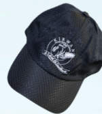
Sports Academy Cap