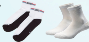
White socks that cover the ankle