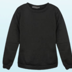
Plain Black Fleece Jumper