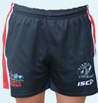
Sports Academy Shorts