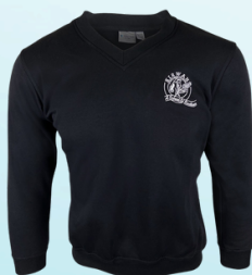
School Black Fleece Jumper