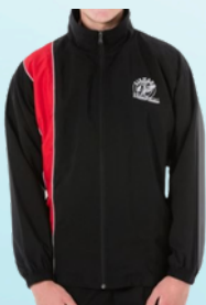
School Track Jacket