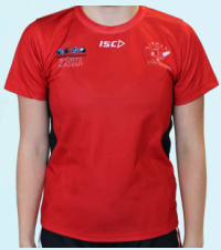
Sports Academy Shirt